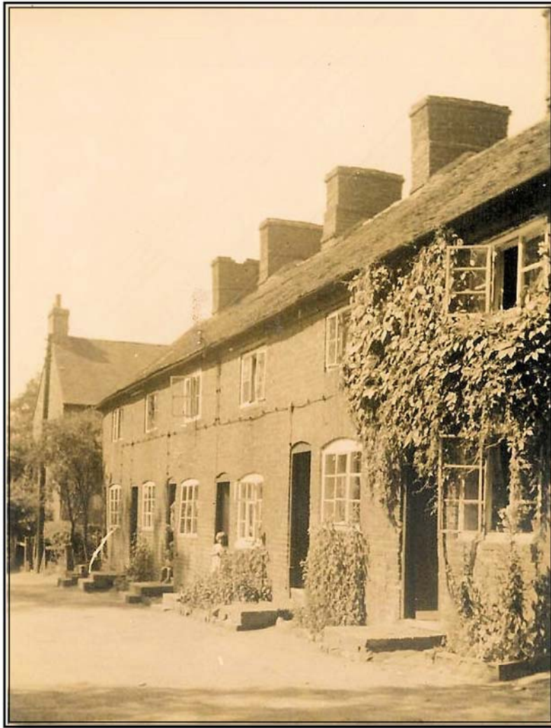
Fisher's Row c1950