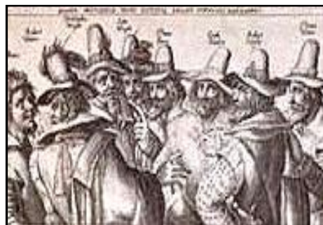
The Catholic Plotters

England would once more be a Catholic country controlled by Rome in the way it had been in the past was something that the majority, especially those in power, did not want. Those figures able to influence events used every opportunity to discredit Catholics and further outlaw the practice of Catholicism. The Plague was blamed on the Catholics and the fire of London was also said to have been started by Catholics. Therefore it was not surprising in 1679 that when a man called Titus Oates suggested to certain people in high places that there was yet another plot to kill the King, this time Charles II, he found them very willing to listen.