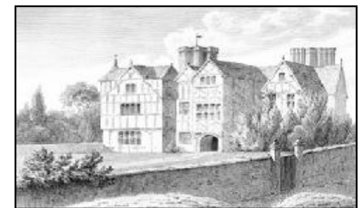
Moseley Old Hall

The attempts by the future Charles 11 to regain his throne from Cromwell also received help from Staffordshire Catholics and eventually forged another link with Colton. Charles 1 had been beheaded and his son, the future Charles11 was trying to reclaim his right to the throne of England. Charles was resoundingly defeated by Cromwell's forces at the Battle of Worcester and had to flee for his life.