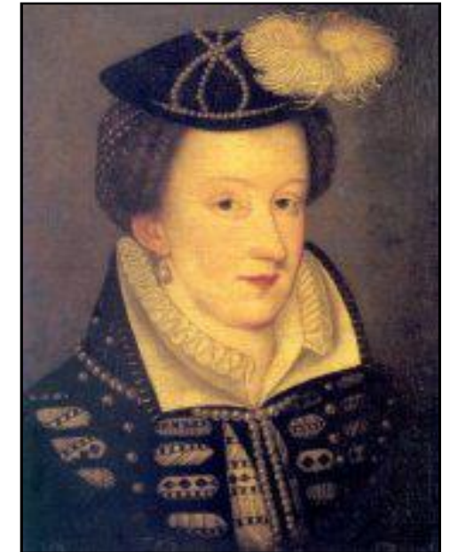
Mary Queen of Scots