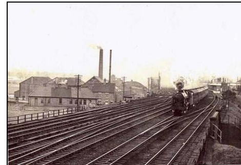
Trent Valley Circa 1950.

Today travel over long distances is commonplace but during pre-Victorian times very few people ever left the area in which they were born. Therefore the coming of the steam engine transformed many communities offering them both opportunities to travel and new forms of employment. This certainly was the case in Colton.