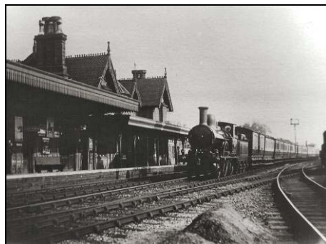
Rugeley Trent Valley Station at Colton circa 1895.

There is no record of the numbers attending. As this latter train proc-