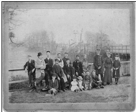
Railway workers and their families.

Many Colton residents have found employment both at Trent Valley Station and on the trains themselves ever since the railway has come to Colton. The Census Records of the following 100 years portray the fact. Some of these workers can be seen in this picture taken at the turn of the 19 th /20 th Century.